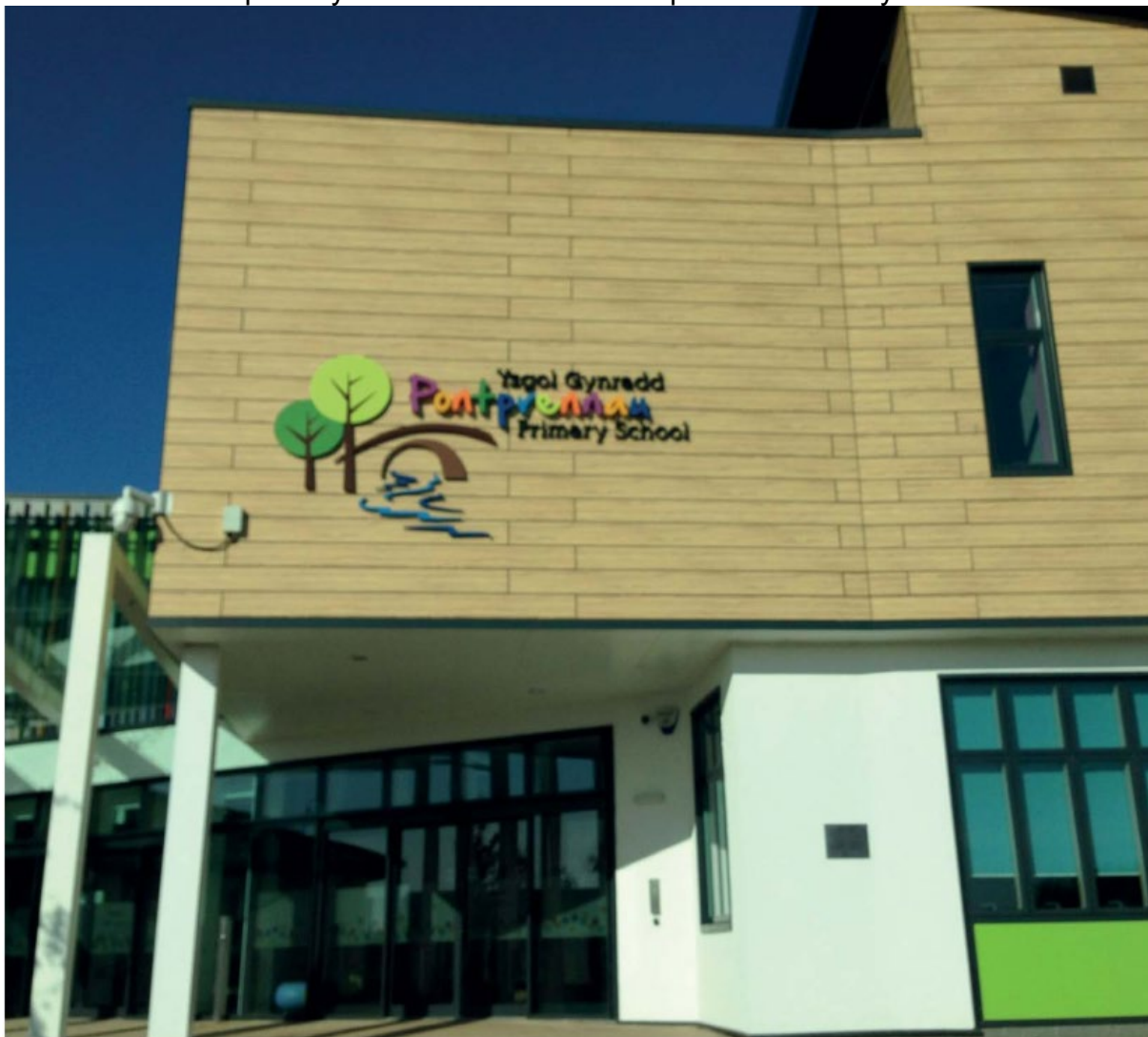
Recent new build primary school in Cardiff – Pontprennau Primary School