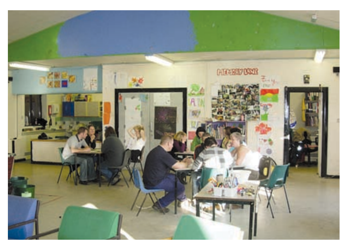
Objective Six – Actively Promote Play in a Positive Way

Aim: To raise the profile of play and promote the importance of play for children and young people's development.