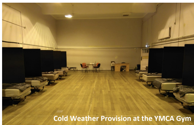
Cold Weather Provision at the YMCA Gym

Being able to offer a placement at this provision has given Outreach workers greater confidence that the accommodation is suitable to meet client needs; service users reliably accept a referral and continue to access the space until move-on options are made available.