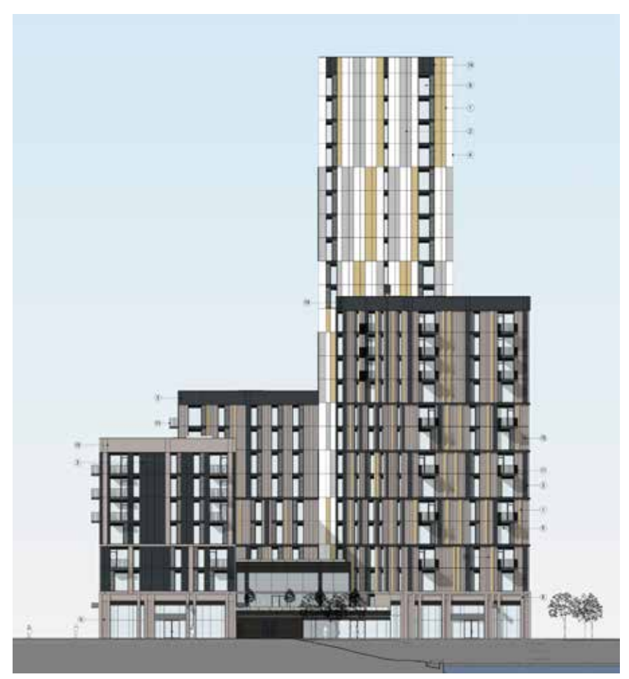
Phsae 2, Plots 1 and 2 of Central Quay Rio Architects

A development of 400 residential units, commercial ground floor spaces and a new footbridge in the second phase of this comprehensive development. The meeting discussed, amongst other things, the indicative nature of the masterplan and the combined effects of this scale of development and apartment floor plans on the character of the city, the retained brewery building and chimney and the amenity of future residents. The mix of apartment types was considered limited. We queried the continuity of the cycle routes to the bridge, and also the perceived safety of the riverside route which includes potential hiding places. Many apartments will gain no direct sunlight. Central cores and circulation areas lack light and social spaces. We noted the common facade treatment to other buildings in the city. The general treatment of the ground floors was considered to be successful with active commercial frontages, a prominent podium and a nice colonnade from the station.