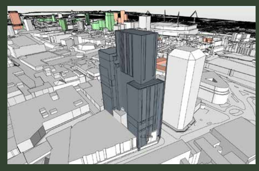
Friary House proposal in the Cardiff city centre and Bay model