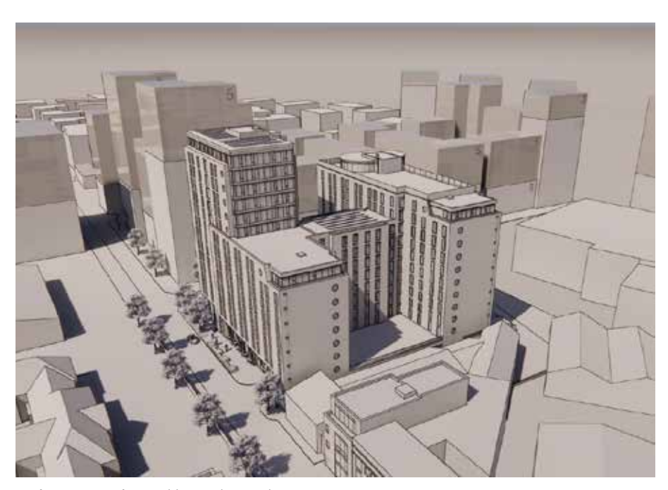
Trade Street Gardens Holder Mathias Architects

The process leading to this submission was discussed, including pre-agreements involving issues of scale and mass. At this stage we queried the quality of the submission which just involved CGIs. We noted how the mass had been adjusted to maintain the level of development but without a clear sense of the impact of this scale on the amenity of residents or the quality of a future street environment which would be cavernous if neighbouring sites are developed to a similar scale.