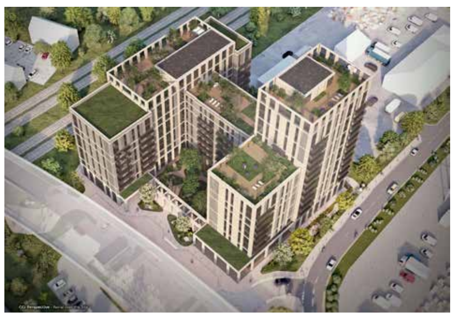
East Bay Close, Rutter Architects

A planning application for a residential apartment building on a site with consent for a student residence. The meeting queried if this site should be used for family accommodation as it is hemmed in by the railway and a flyover. We sought evidence of neighbourhood facilities within walking distance. The scheme was adjusted to improve light conditions and the residential landscape, including opportunities for active play. The building was generally thought to be elevationally attractive.