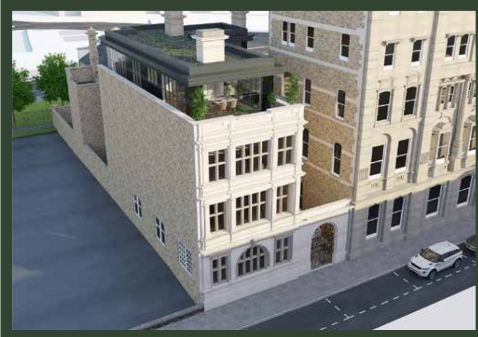
Custom House, Bute Street Lawray Architects

(22/00482/MNR): The proposal was on the site of a previously refused scheme, and for an interesting contemporary home in a relatively traditional area of the city. We welcomed the careful contemporary approach but some queried how it sat with neighbouring homes. We modelled the house subsequently to judge its mass and form, and some suggested that we should support contemporary architecture in such a setting.