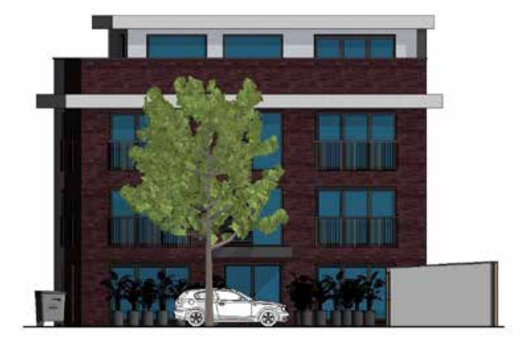
Queen Anne Square Hafren Designs

The proposal for a bulky and bland four storey apartment building within the Queen Anne Square conservation area was considered a poor design with little regard for the qualities of the wider context.