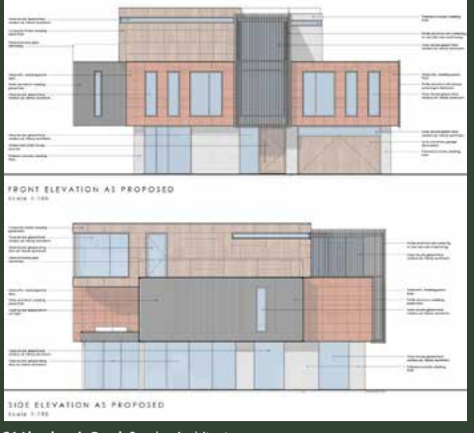
21 Llandennis Road Sunder Architects