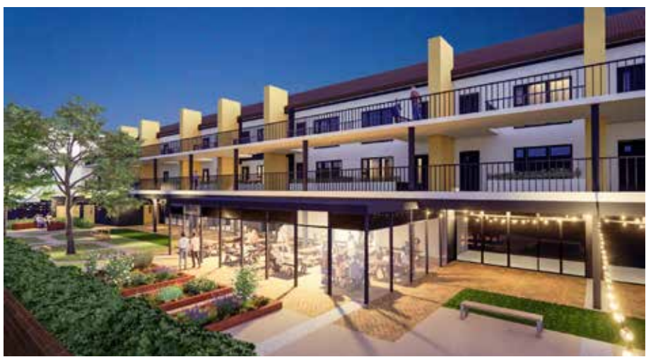
Moira Terrace Powell Dobson Architects