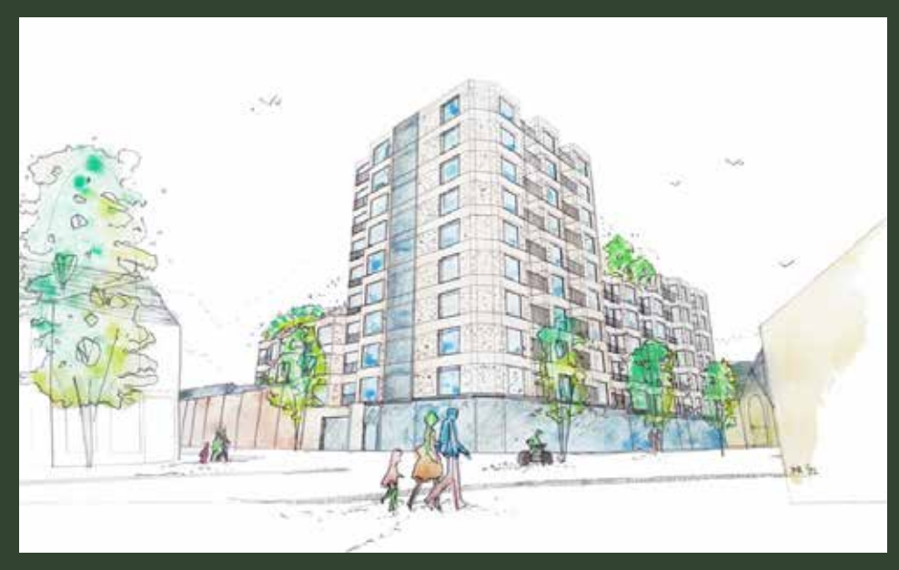
51-56 Cowbridge Road East and 2 - 8 Lower Cathedral Road Benham Architects