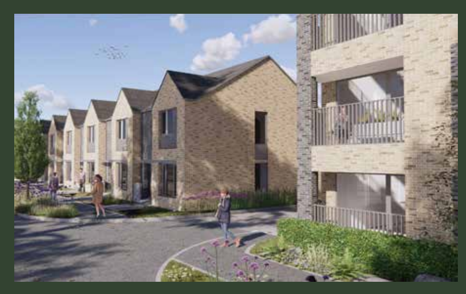
New homes on the site of the former Lionite Miele on Sanatorium Road Roberts Limbrick Architects

The proposal involves the conversion of an original office building to become a shared living development. The proposal involves adding floors to the original building which no one was concerned about. The original scheme that the meeting reviewed included a low level of communal living space.