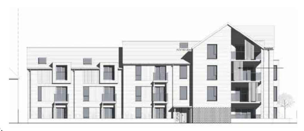
Former Duke of Clarence Hotel, Clive Road Chamberlain, Moss, King Architects

The proposal, on the site of a former pub, was a little lower in height than a previously approved scheme, but with a wider footprint which threw out a few amenity issues in terms of neighbour impacts. The design of the facades was generally considered attractive, and an improvement on the previous design.