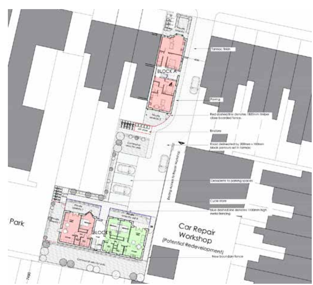
Former Lionite Miele

The third attempt to find an acceptable solution to the development of the site, the design threw out a few amenity issues in terms of its impact upon immediate neighbours.