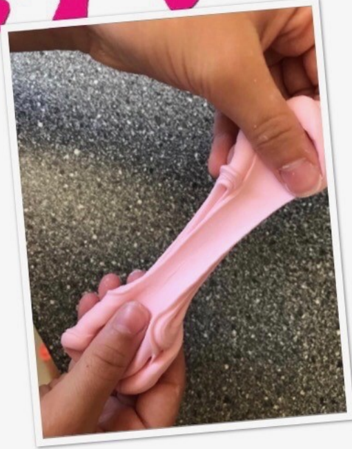
Bowl cornflour hair conditioner Food colouring

Step 1 Squeeze conditioner into the bowl