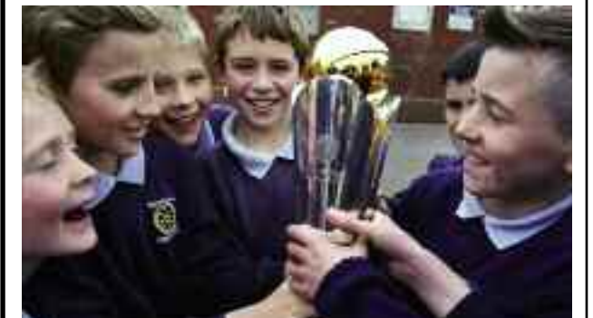
• Pupils from Ysgol Gymraeg Melin Gruffydd get their hands on the ICC Champions Trophy