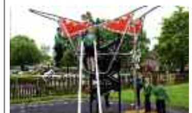
Rumney Rec gets exciting makeover - see page 5