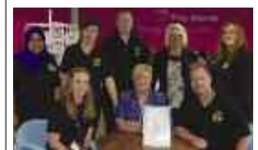
Marland House Advice Hub open for business - see page 4