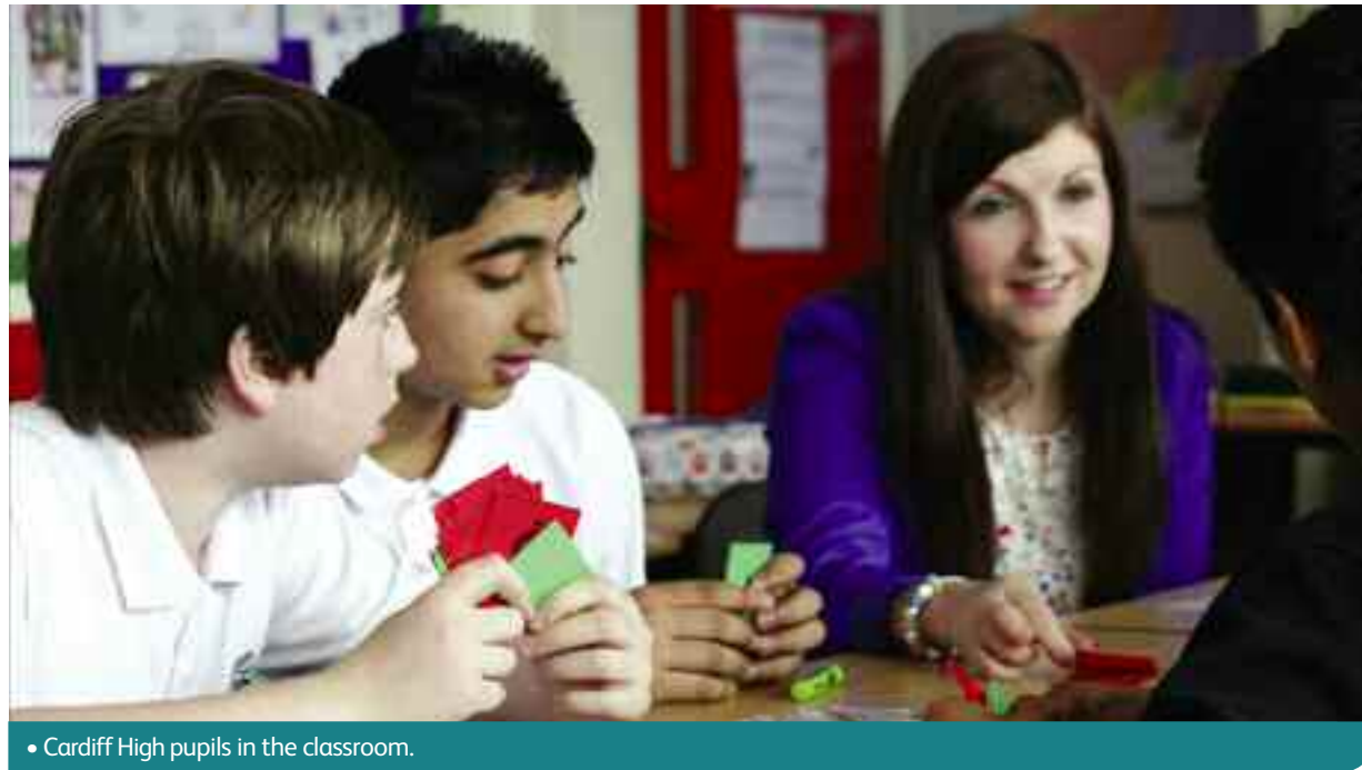
• Cardiff High pupils in the classroom.