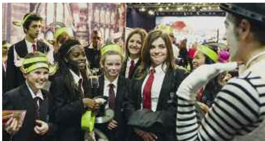
• Pupils enjoying the Choose Co-operative Festival.

Cardiff Council will now finalise its legal terms with Bouygues Development so that it may proceed with detailed planning work on the scheme. It is anticipated the work could start on site next year subject to planning consent.