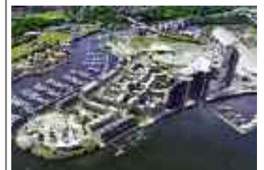
Cardiff Pointe development underway - see page 3