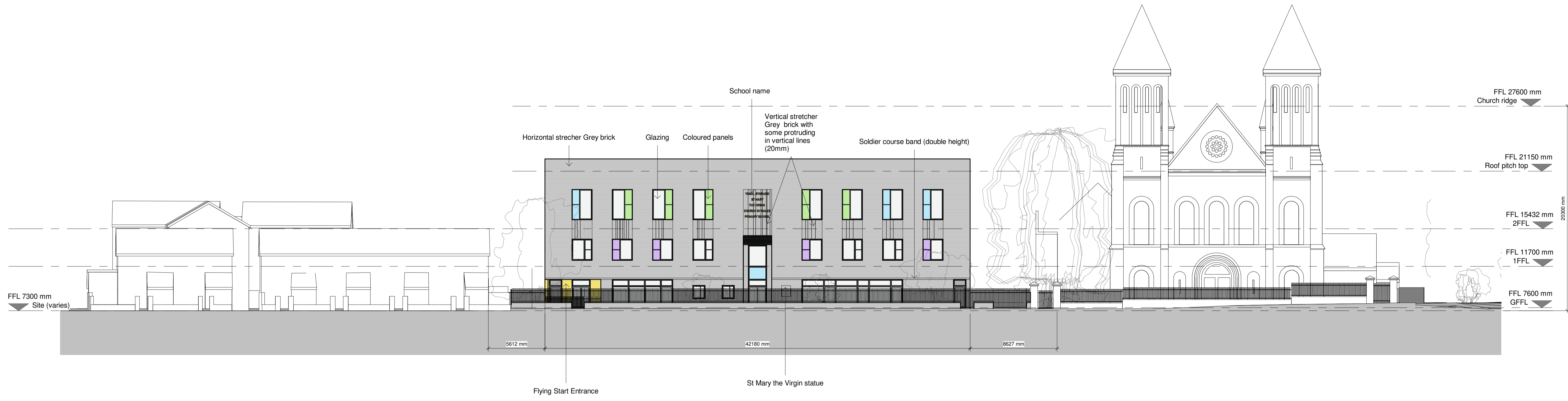
Proposed North East Elevation (main) 1 : 200