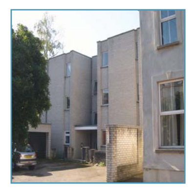
Examples of the various styles of building within and bordering the Conservation Area

The Conservation Area has since designation, remained largely unchanged in both form and composition. The most apparent changes have been modifications to building frontages and street paving on Wordsworth Avenue, Southey Street and Cowper Place.